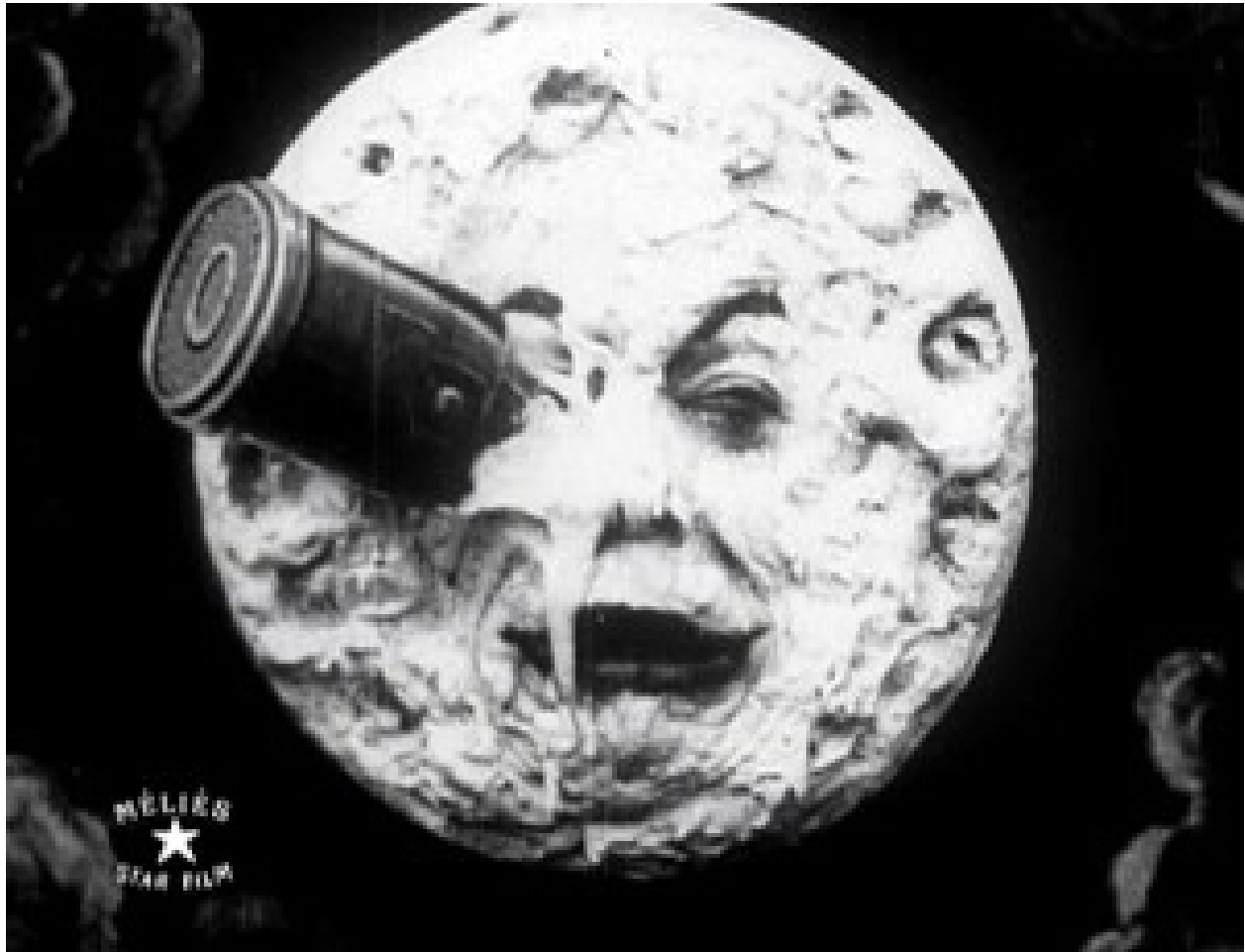
Figure 1: A Trip to the Moon (dir. George Méliès, 1902).

This dissertation is divided into roughly four different sections of unequal length and emphasis. My engagement with the work of David Foster Wallace is the most extensive and most assiduously researched. With his death in 2008, I had the opportunity when I began writing in 2010 to actually read everything. Everything he had published, every critical essay, book, and the important book reviews. Nearly all the interviews. Even the juvenilia and miscellany. Of course I would have preferred that he had kept living and writing, but I had the opportunity to begin from a position of archival totality when I started writing about him, a rare position to be in indeed. So I was perhaps a bit more encyclopedic than necessary. This section has since been