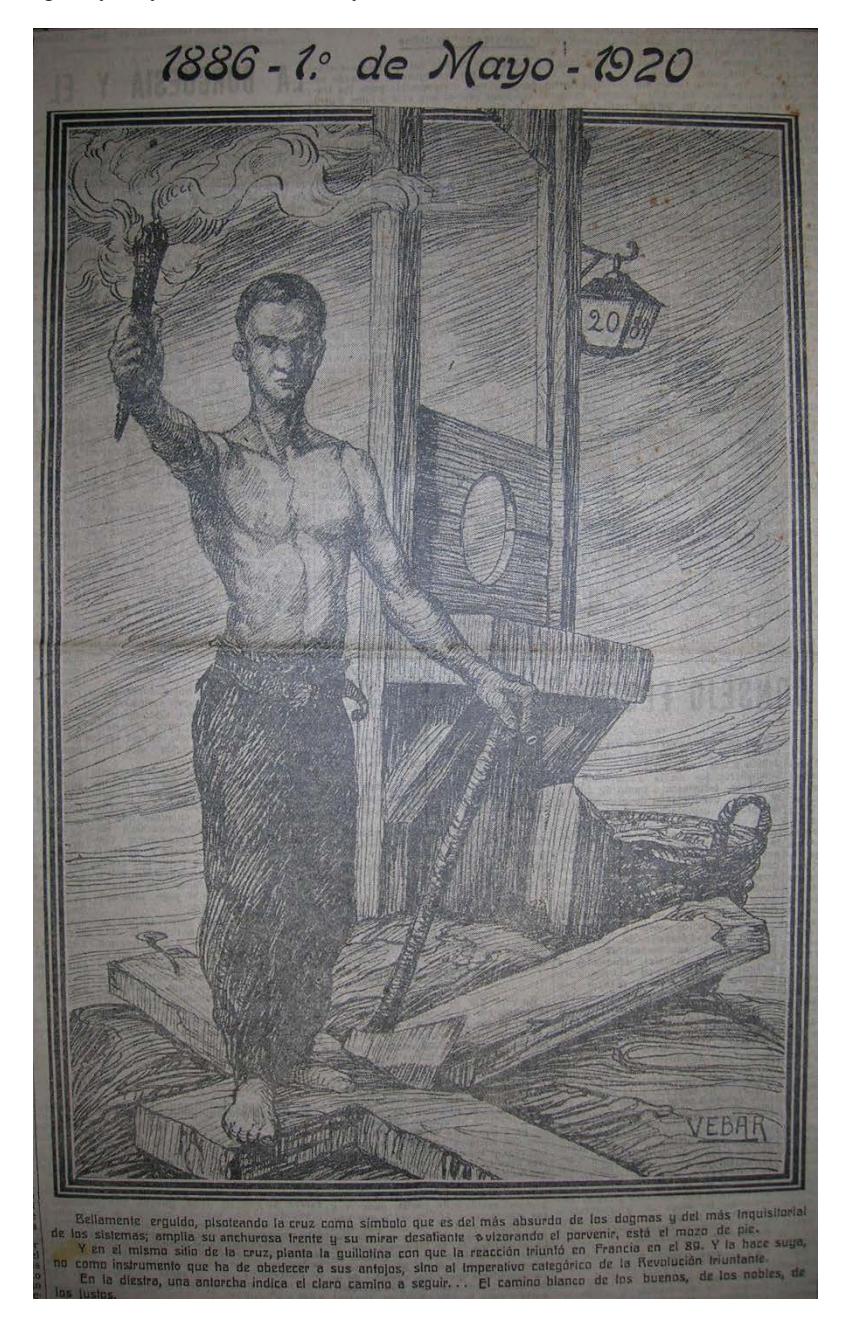
Figure 5 . A shirtless male (probably representing a worker) has cut down the cross and, perhaps out of the very wood of "superstition," built a guillotine. Instead of religious mystery, he offers light and, through the guillotine, justice. The lamp hanging from the guillotine gives the current date—1920—and the artist appears to indicate another watershed moment in modern social discontent: the French Revolution of 1789. The newspaper is celebrating May Day. Solidaridad , May 1920, 1.