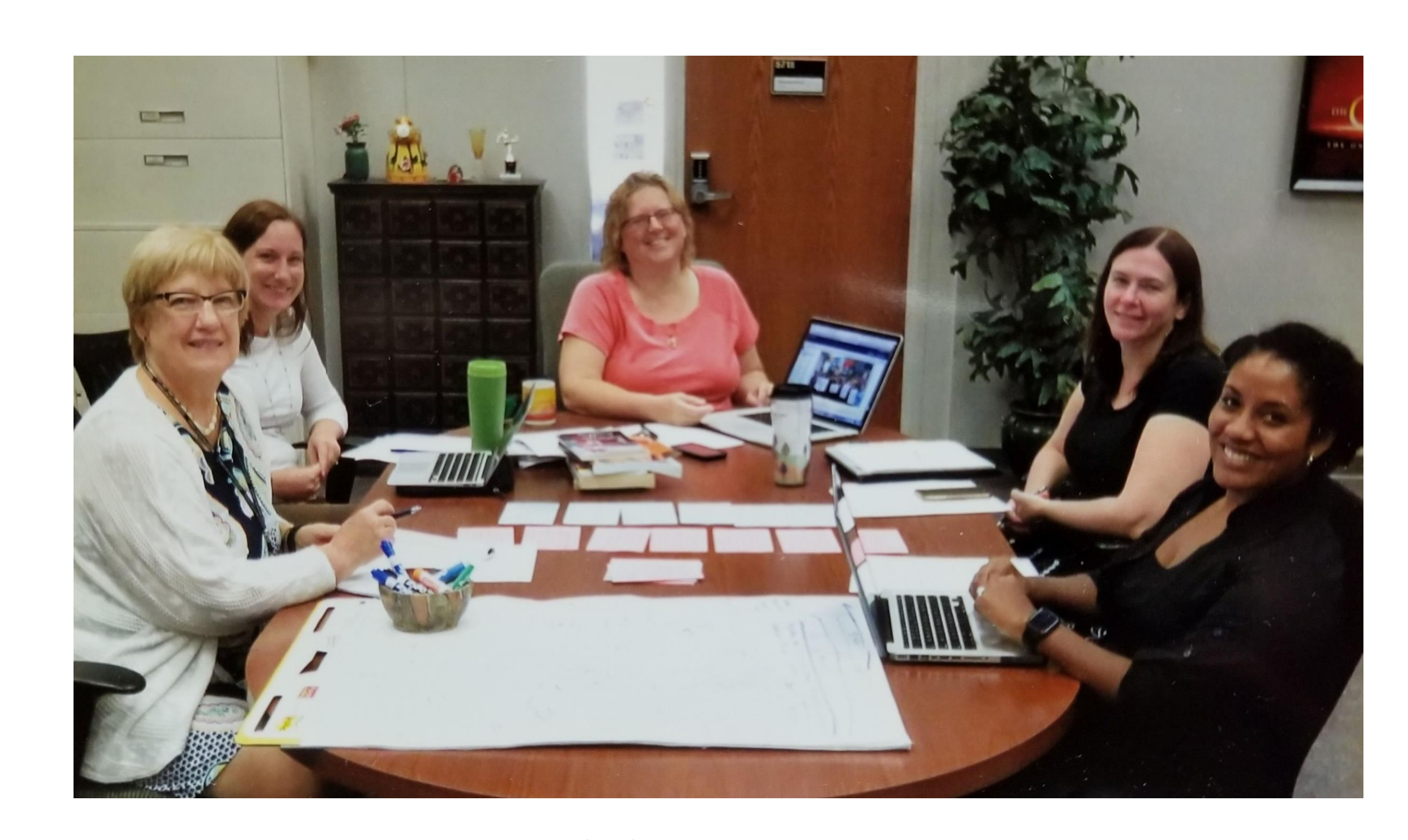
Extended Diversity 2016-17 Faculty, Librarians, and Instructional Designers working together