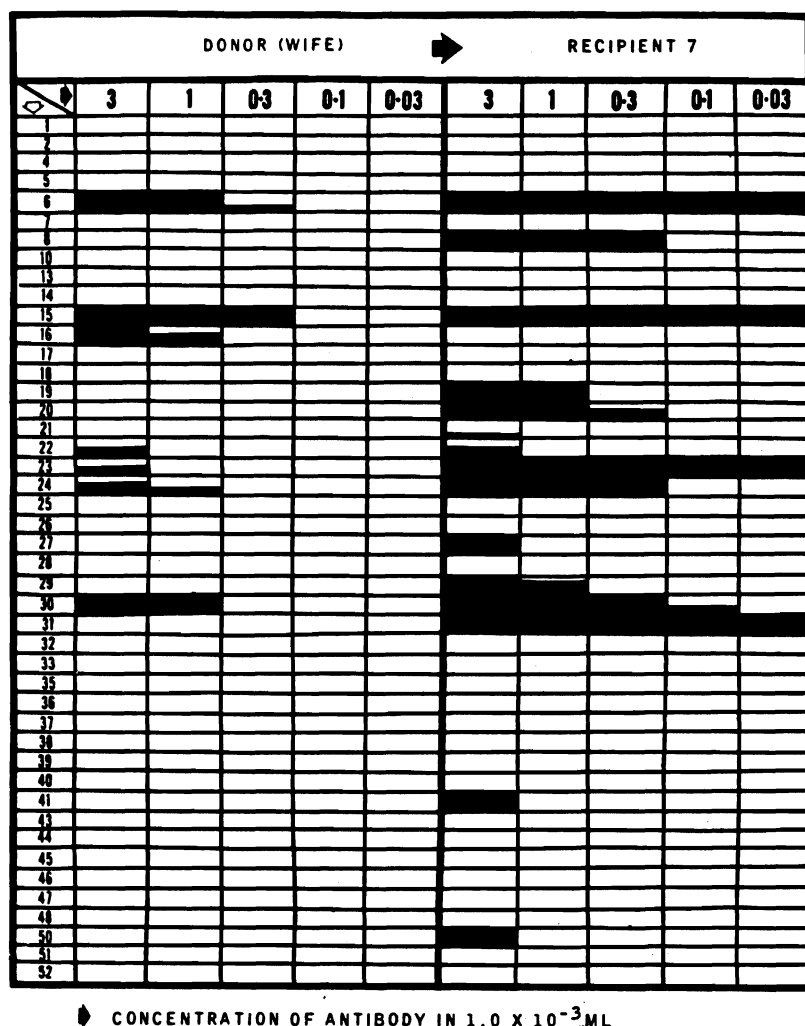
Figure 3.—Lymphocyte-cytotoxicity titration of a donor (wife) and unrelated recipient (#7). The results are plotted as in Fig. 2. Of particular interest is the fact that the donor possessed only one antigen that the recipient did not, whereas a graft in the opposite direction would have been incompatible for 8 antigens.

An incompatibility in which the donor reacts with a given antiserum and the recipient does not is not open to the same polyvalent-antiserum criticism. Cells of the donor may react on the basis of A, B, C, . . . Z antigens, whereas the recipient can be taken to lack all these antigens from a negative reaction. This type of incompatibility, however, does suffer from another difficulty, in that a non-reactive cell may be capable at times of absorbing out cytotoxicity (Becker and Tera-