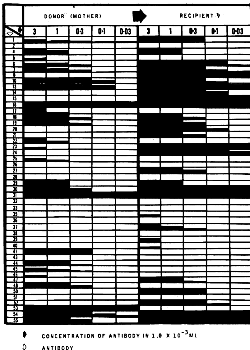
Figure 2.—Lymphocyte-cytotoxicity titration of the donor (mother) and recipient (#9). The antisera are listed on the left and volumes of the antisera tested \times 10^{-3} ml are given in the top row of figures. The approximate extent of cytotoxicity at each dilution is denoted by the height of the dark bars. Incompatibilities are present wherever the donor (shown on the left) reacts with a serum and the recipient does not.

having identical antigens. This difficulty can be circumvented, at least theoretically, by absorbing the sera with recipient cells and testing with the donor cells (Becker and Terasaki, submitted for publication). In a few instances in which this procedure was adopted for all reactions for which the donor