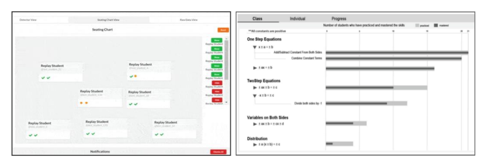
Fig. 4. Left: prototype of the Lumilo Tablet real-time dashboard, with students displayed as blocks within a Live Dashboard "Seating Chart" component. Right: a prototype of the Luna lesson-planning dashboard, showing the class-level view.

Luna was developed using the Live Dashboard and AggHouse tools. As with Lumilo, the primitive level of data upon which Luna relies are student model updates, computed by plug-in detectors which are distributed across students' client machines.