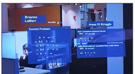
Fig. 3. Left: Point-of-view screenshot of teacher using Lumilo to monitor a class of students (taken directly after class). Right: Teacher's view through Lumilo after selecting a student, to view more detailed information for that student [17].