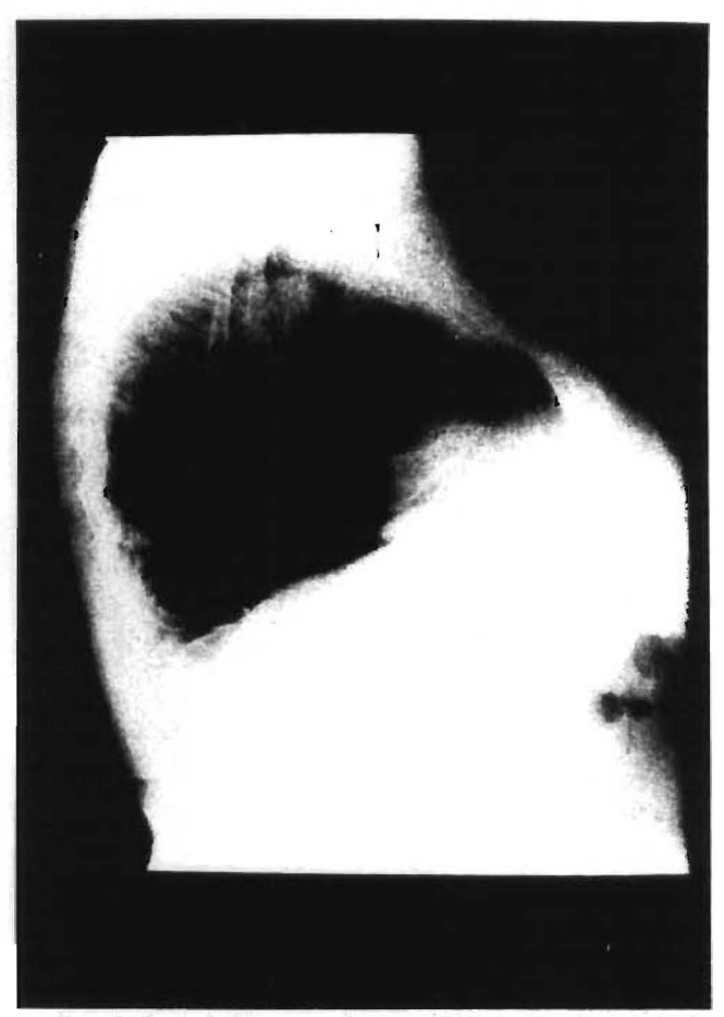
FIG. 5. Lateral chest x-ray January 1981 showing increased mineralization of the spine (healed sternal fracture and sternal curvature similar to March 1979).

This patient's course suggests that patients who might not ordinarily survive their liver disease to develop hepatic osteodystrophy, if treated with liver transplantation may develop severe bone complications. This complication might be prevented if careful attention is paid to vitamin D treatment. In those patients on corticosteroids vitamin D therapy may also improve or delay bone changes seen with glucocorticoid-induced osteopenia (19).