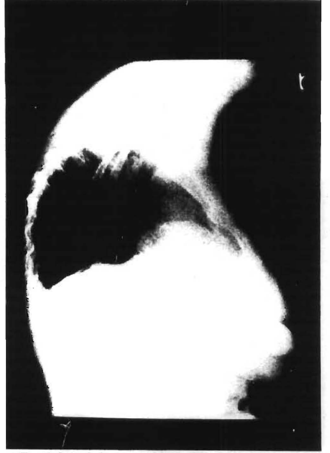
FIG. 4. Lateral chest x-ray March 1979 showing healed sternal fracture and increased curvature of the sternum.

with one exception of a value of 2.4 mg/dl, so that osteomalacia solely due to antacid ingestion seems unlikely, but it may have been a contributing factor.