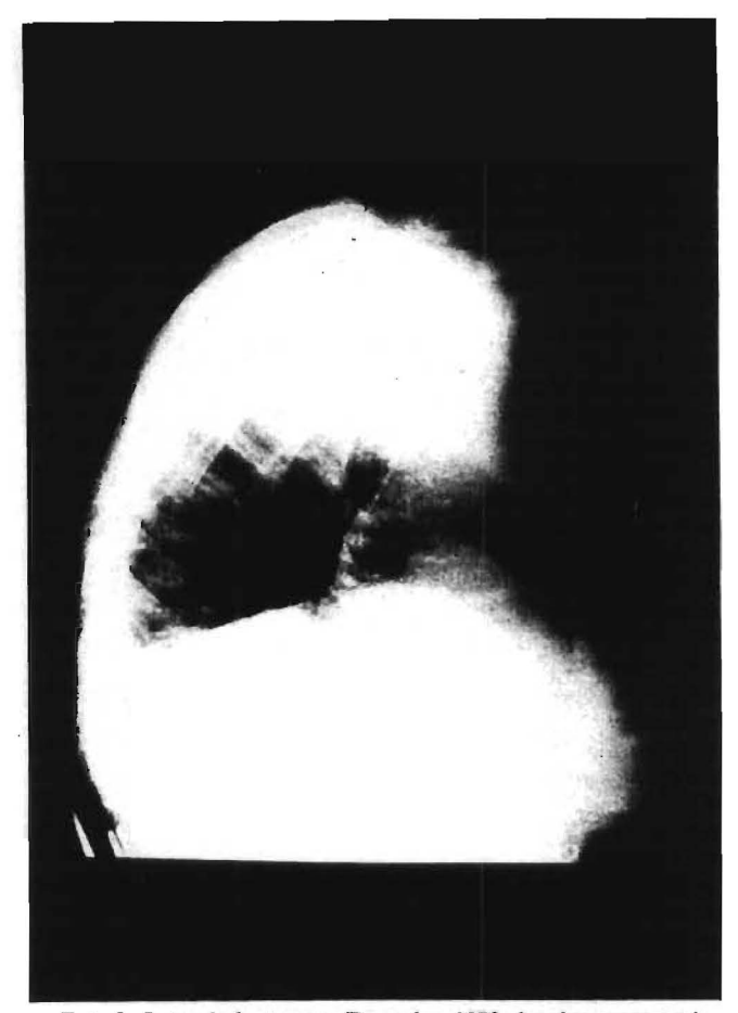
FIG. 3. Lateral chest x-ray December 1978 showing compression fractures of the spine.

The bone disease in this woman was undoubtedly multifactorial. She took antacids before and after the transplantation. Antacids may cause phosphate malabsorption which can then lead to osteomalacia (13). However, her serum phosphate levels were normal repeatedly,