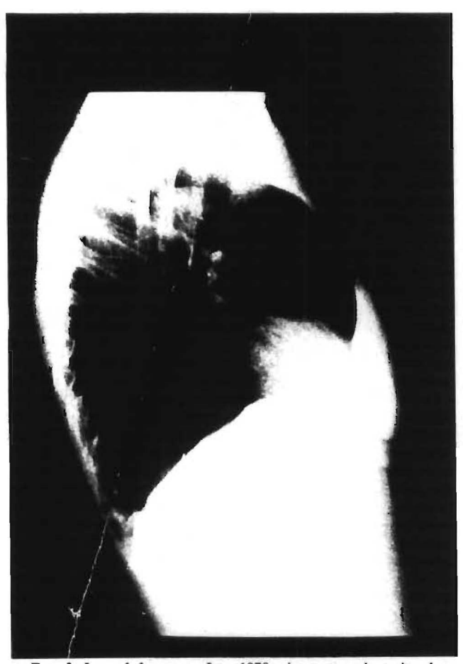
FIG. 2. Lateral chest x-ray June 1978 prior to transplantation showing a structurally normal sternum and demineralization of the spine.

to be reduced in some patients with severe primary biliary cirrhosis with the bone lesions of hepatic osteodystrophy (5) and normal in some others (1). Possible reasons for decreased 25-hydroxyvitamin D levels are decreased hepatic 25-hydroxylation of vitamin D, malabsorption of vitamin D, and increased urinary losses of vitamin D or of its metabolites (8, 9).