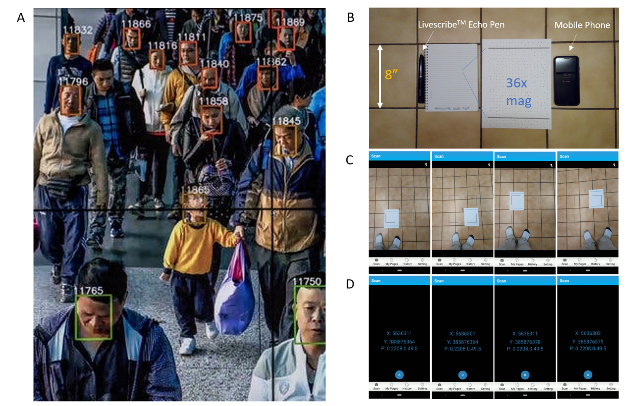
Figure 3. Precise geolocating of the masses versus precise geolocating for the masses. A. Face tracking in China (photo adapted from Ref. (19)). B. Visual positioning technology. Left-to-right: a pen that can stream its location on lightly patterned paper, within the diameter of its ball point at 70 Hz; notebook used with pen; 36x magnification of printed sheets; Android mobile phone capable of running a free mobile app (Anoto aDNA (20)). C. Four frames of aDNA Scan app at four edges of printed sheet. D. Integer cartesian coordinates returned by the app. One-inch resolution from waist-high distances is readily achievable at high frame rates using ubiquitous mobile phone technology. Still frames of C, D taken from a video captured by an Android phone running the aDNA app: <a href="https://youtu.be/9Bc0PBYm5-8">https://youtu.be/9Bc0PBYm5-8</a>.