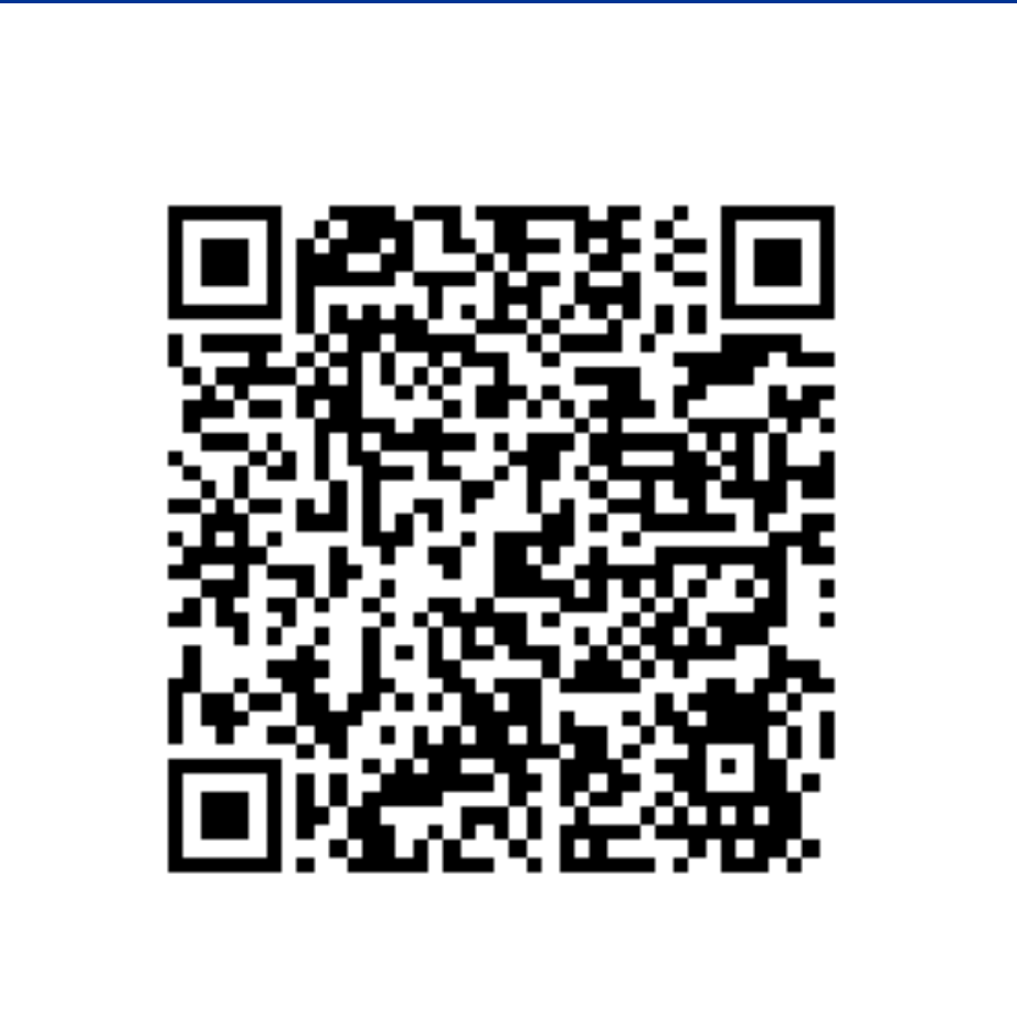
Course syllabus and sample materials are available here