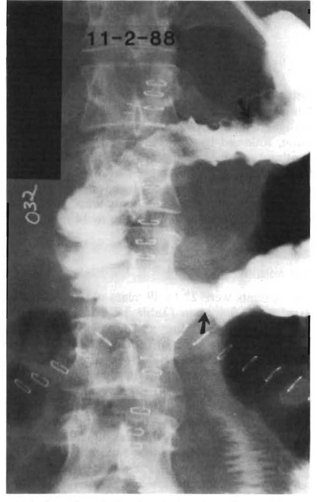
Fig. 2. Gastrointestinal series obtained in Patient 5, showing homograft duodenum and jejunum in continuity with patient's own stomach and jejunum. This segment of intestine has function as a true intestinal homograft for 11 months.