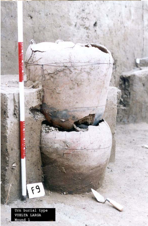
Figure 12 Chimney Tomb, VL-T1