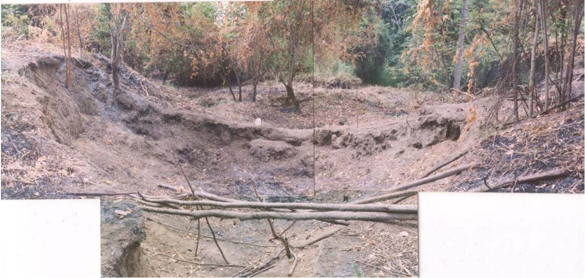
Figure 7 Vuelta Larga Mound, Prior Excavation