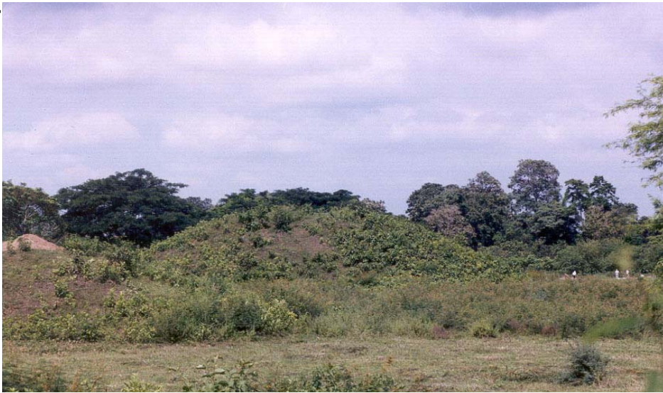
Figure 2 Mounds 2 and 3 of Jerusalén Site