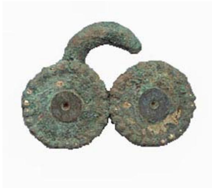
Figure 15 Noserings Found as Offerings