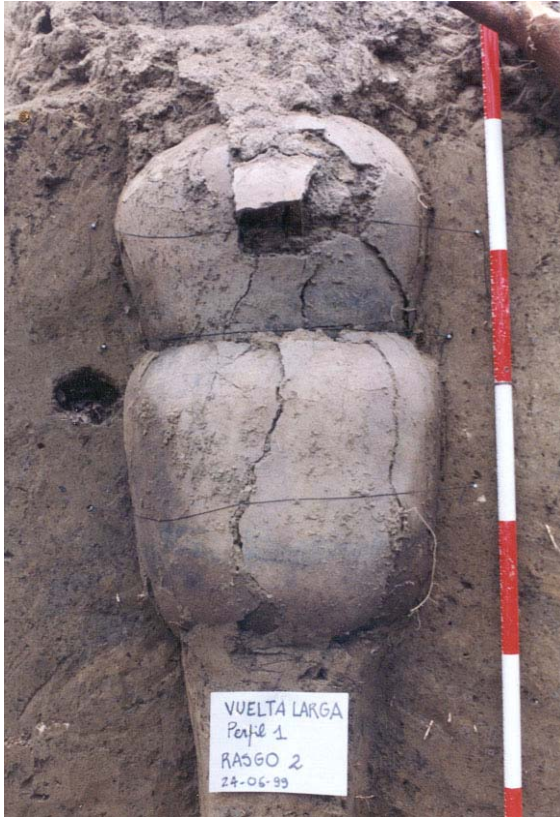
Figure 13 Section View of a Chimney Tomb