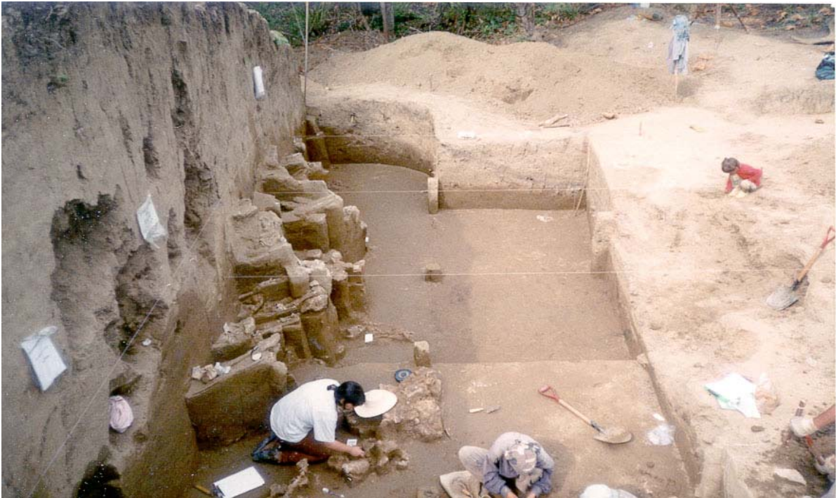
Figure 8 General View of the Excavation of VL-T1