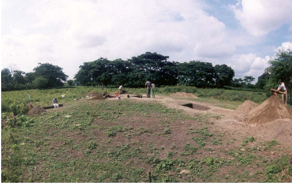
Figure 5 Mound J9 During Excavation