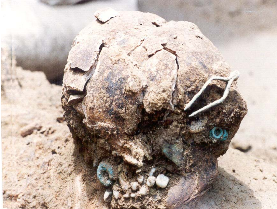
Figure 9 Cranium with Offerings