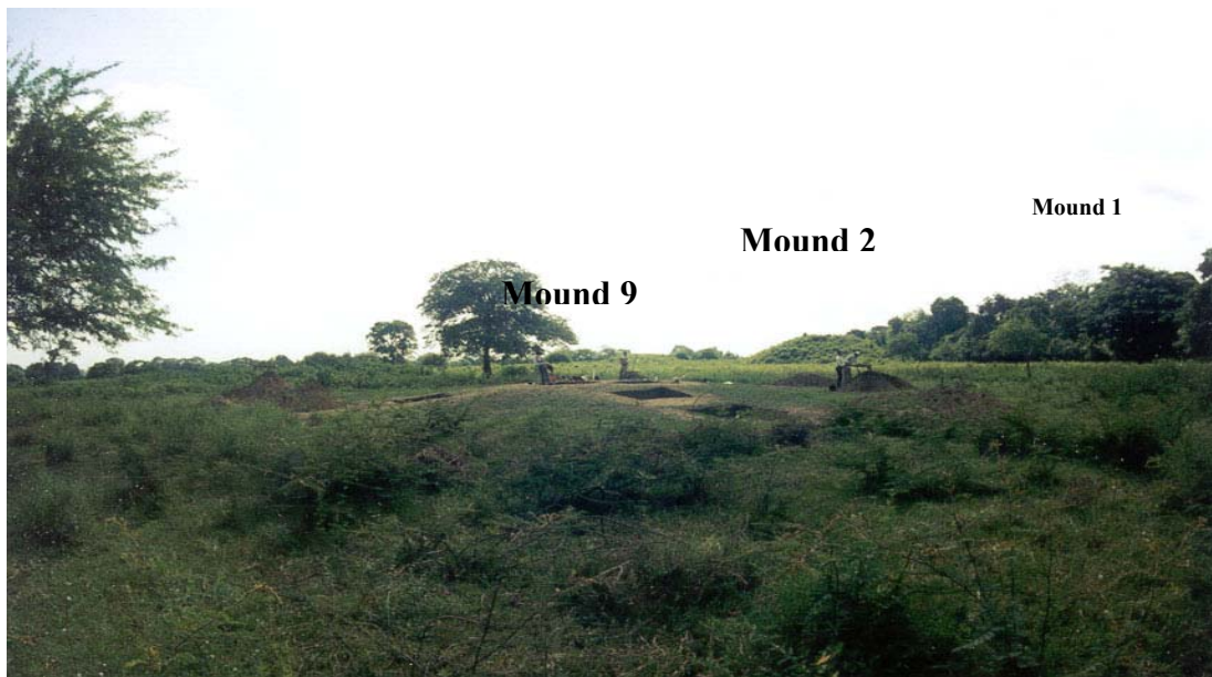
Figure 6 Public Mounds (1 and 2 ) and Domstic Mounds (J9)