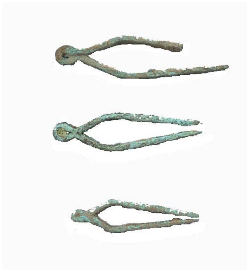
Figure 16 Cooper-Arsenic Alloyed Tweezers Found as Burial Offerings