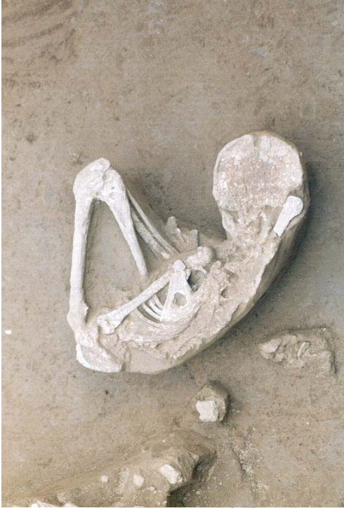
Figure 11 Burial Found in Flexed Position