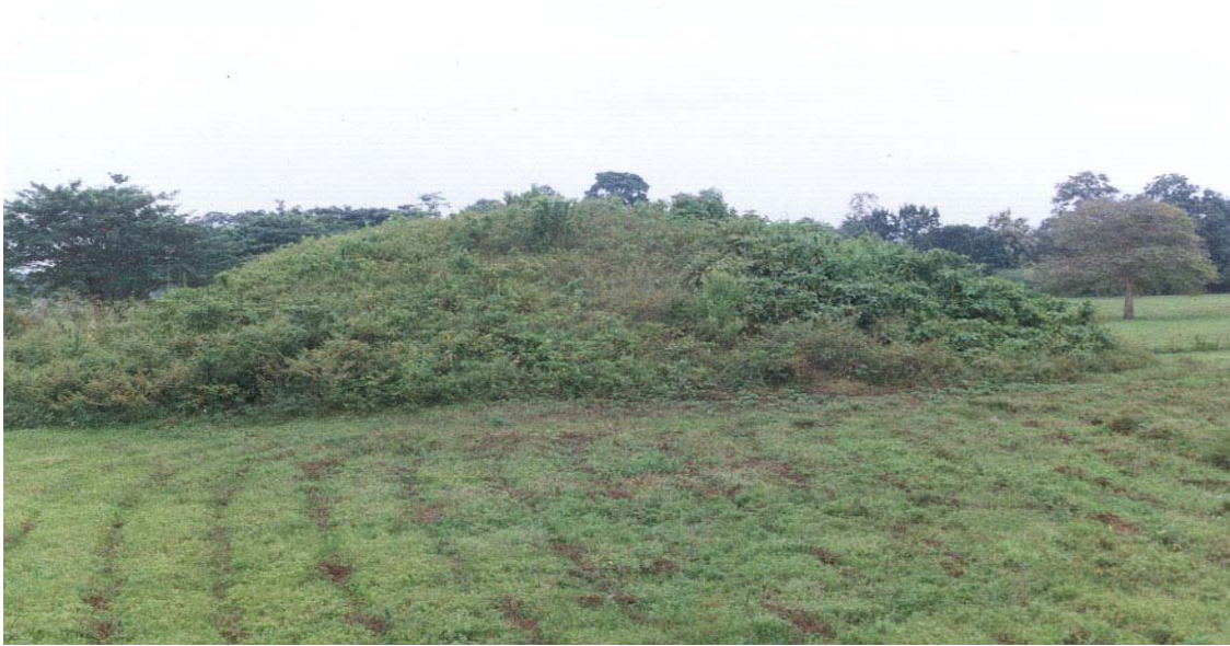
Figure 3 Iguano Macho Mound