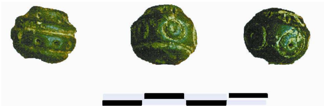
Figure 17 Spindle Whorls Found in Vuelta Larga Mound