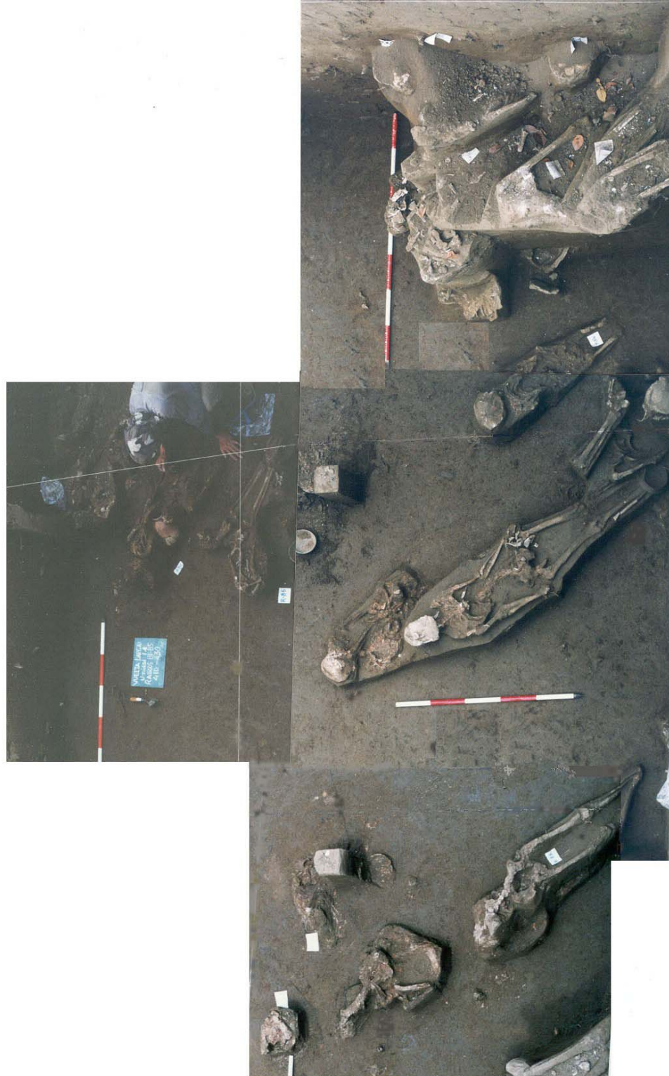
Figure 14 General View of Burials at Vuelta Larga Mound 1