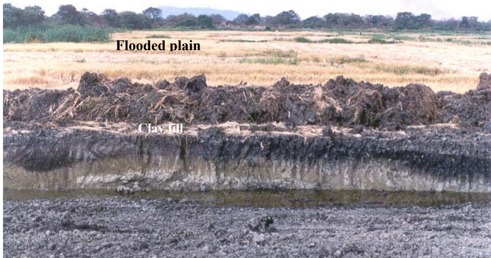
Figure 4 Raised Field Profile