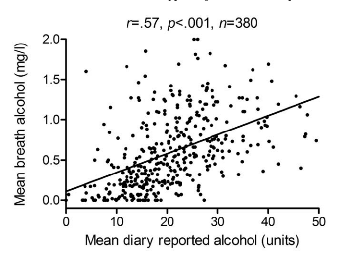
Figure 3. Scatterplot showing the relationship between breath alcohol and diary reported alcohol units. Note that 1 UK unit of alcohol = 10 millilitres or 8 grams of alcohol. doi:10.1371/journal.pone.0022994.g003

The principle finding of the study was that attendance at treatment sessions was associated with decline in alcohol consumption reflected in mean breath alcohol recordings, the percentage of clients achieving a zero breath alcohol reading, and diary reported alcohol units. Although the absence of a control group exposes this association to 'non-causal' explanations, such as selective attrition of higher drinkers or the simple passage of time, the absence of direct evidence supporting these accounts speaks in