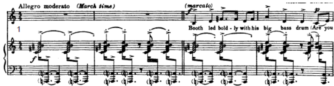
Figure 9. Atonal accompaniment, mm. 1-4

The harmonies in this passage are ambiguous; there is simply not enough information for the listener to easily hear any tonal implications in this harmony, and coming at the beginning of the piece with no context in which to place it, the opening two bars must be considered atonal. That the harmony is not a functioning dominant is made clear when the voice enters at m. 3, outlining a B minor triad, with the opening chords continuing as accompaniment. The same piano texture, using similarly constructed harmonies, does continue into mm. 5-8, where it serves to both confirm and contradict the tonal melody in those bars, this illustrates the fluidity of Ives' material, which helps to make the continuum of tonal coherence possible.