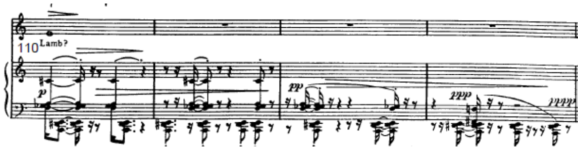
Figure 18. Mm. 110-113

percussiveness to harmonies (whether suggestive of tonality or not), or to act as a basic signal of atonality. Both sets are used in the final four bars of the song to accomplish both tasks: