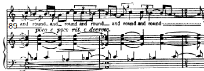
Figure 2. Adagio passage, mm. 81-90

This is the climactic moment of the song, both musically and textually. The Lord emerges to survey and bless Booth and his congregation; the frenetic and raucous march gives way to a serene adagio . This passage is also, at the slower tempo, the longest section of a sustained texture in the song, giving it even more weight.