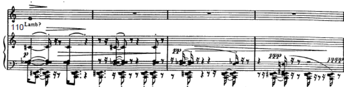
Figure 10. Atonal conclusion, mm. 110-113

The most tonally inexplicable passage in the song occurs at the very end, just as the voice and piano conclude the piece's most tonal moment::