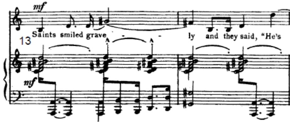
Figure 13. Appoggiatura in m. 13

As noted earlier, the B minor triad with which the vocal melody begins in m. 3 is tonally ambiguous. This triad returns in m. 13, now embellished by an appoggiatura on G# which resolves to the fifth of the chord: