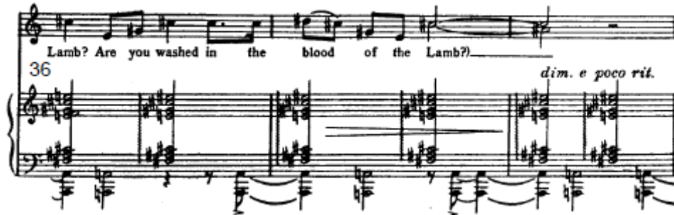
Figure 12. Accented upper neighbor in m. 37

Having already heard the tune once in a more or less tonally coherent context, the listener will to some extent supply tonal implications to this melody where they do not actually exist. The expected tonic triad E-G#-B is distorted so that \hat{5} becomes C#, turning a root position major triad into a first-inversion minor triad, thus weakening any sense of key or function. 10 It is the accented upper neighbor on 'blood' which signals a relationship with tonality. Despite the distortion of the hymn tune in this phrase, the D# still functions as an such a non-chord tone should – it is the upper neighbor of the top note of the triad (whatever its 'function') outlined by the melody, and just as significantly, it is dissonant. The D# is dissonant in terms of the melody and also the accompanying harmony, which, for all its richness and ambiguity is nevertheless triadic, but contains no D#. The C# in the melody, despite its ambiguity in terms of a tonal melody, is not dissonant, being amply represented in the harmony. The accented upper neighbor gives the melody, and therefore the entire phrase, a tonal significance that it would not otherwise have.