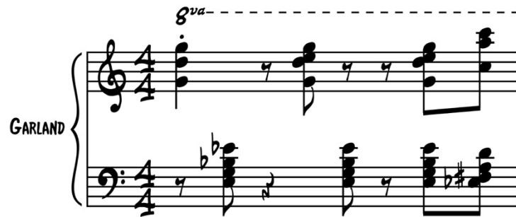
Figure 18. Garland: “Billy Boy” Second Head, m5

head; the accentuation is further punctuated by Jones's snare comping and Chamber's bass hits. (Figures 18-19). In the fifth measure, Garland also alters the quality of the left-hand chord by flattening the seventh and raising the ninth; what was Cmaj9 is now C7(#9):