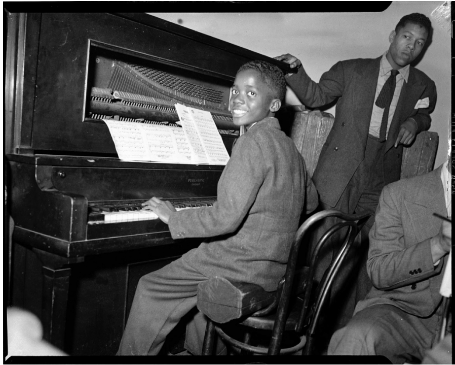
Figure 3. Young Ahmad Jamal (Fritz Jones) playing piano, c. 1942