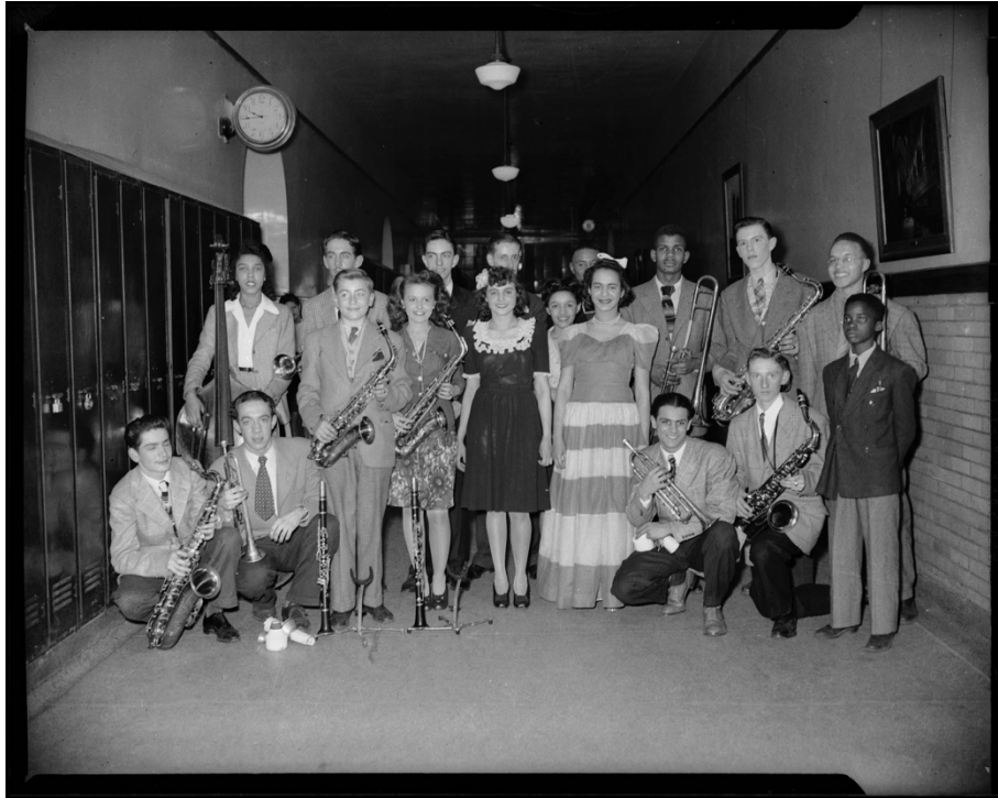
Figure 4. Westinghouse High School swing band "The K-dets," c. 1943-1944.