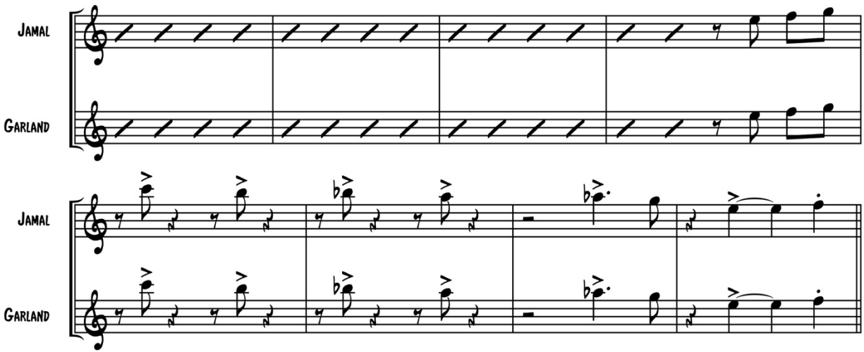
Figure 16. Jamal-Garland Stacked Scores: “Billy Boy” Head B-Section

Thematically, Garland also copies Jamal’s final A-section; its sharp, syncopated block-chords resemble a big band shout chorus. In addition to slight rhythmic reductions, Garland stays closer to the natural motivic sequences than Jamal’s original, which builds to a climax in measures 7-8 of the chorus. After that, Jamal briefly resumes the melodic strain, but instead of finishing it, veers off into a four-measure lead into his first solo chorus. Garland, on the other hand, chooses to complete the phrase in measures 13-15. Figure 17 reduces the thematic material of the melodic strain alone for ease of comparison: