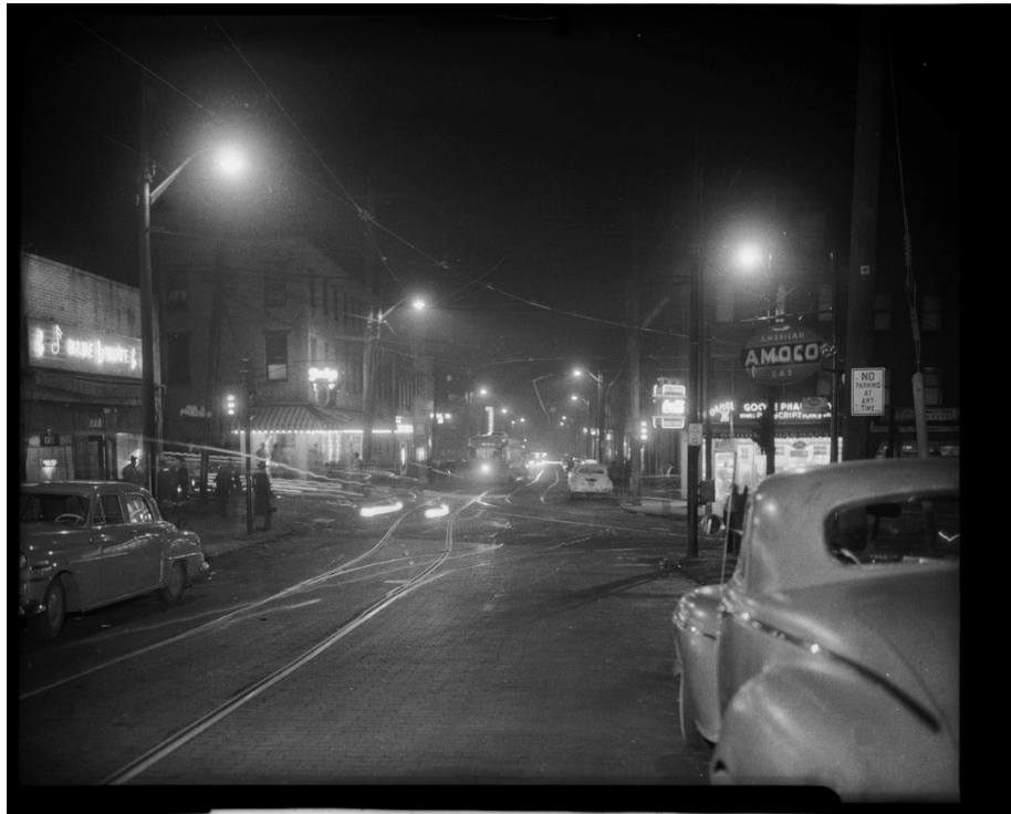
Figure 1. Intersection of Wylie Avenue and Fullerton Street with Blue Note Cafe and Goode Pharmacy, on foggy night, Hill District, c. 1945-1965