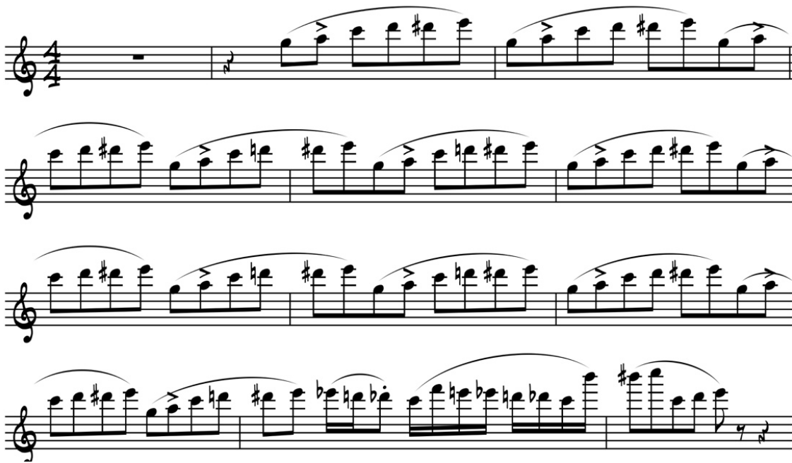
Figure 38. “But Not for Me” (1958) six-note riff into solo chorus

He continues in this manner for the majority of the performance, offering moments of nearly-identical phrase structure to his earlier recording that break off into newly-improvised ideas and back again. The pitch classifications are virtually identical at these points of self-emulation, but Jamal modifies the rhythm and ornamentation in a manner that preserves the spontaneity of new material. By mapping Jamal’s use of new and reused content (Figure 39), we can ascertain the extent in which Jamal tropes his own improvisations for his performance of “But Not for Me” at the Pershing, noting specifically the relationship of the head, two solo choruses, and coda material to the 1952 recording: