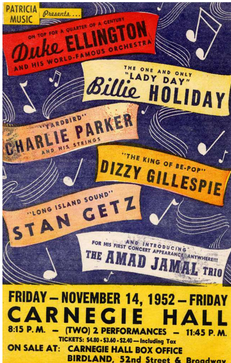
Figure 10. Poster advertisement for the Carnegie Hall concert. 216