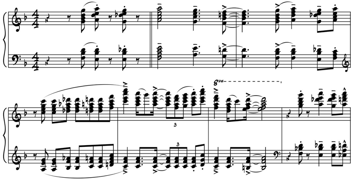
Figure 40. Locked-hands style in “But Not for Me,” second A-section of the second chorus (1958)

After seven measures, he makes an abrupt detour with a brisk two-measure phrase of single-note sixteenth notes, before concluding the paraphrased head melody with a Basie-like, light embellishment of the melody in the upper register (Figure 41):