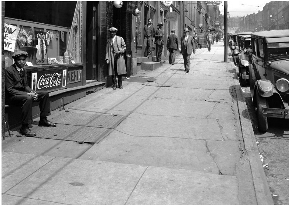
Figure 5. Furnished Rooms, 1213 Wylie Avenue, looking east, April 29, 1930.

Nevertheless, by the time he reached fourteen, he was getting so much work around town that he had to join the musicians' union. Because the minimum age was sixteen, he had to lie on his application, but the president was from the nearby neighborhood of Homewood and let it slide. 108 As a member of the African-American Local 471 of the American Federation of Musicians, Jamal gained access to the Musicians' Club in the union's building located at 1213 Wylie Avenue in the Hill District of Pittsburgh. For Jamal, the Musicians' Club was the center of his musical training, "the dome of the capital as far as music was concerned." 109