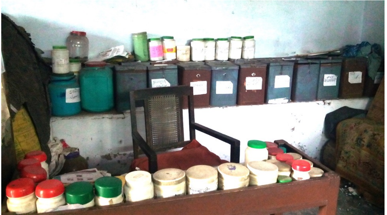
Figure 4. Inside a Unani clinic