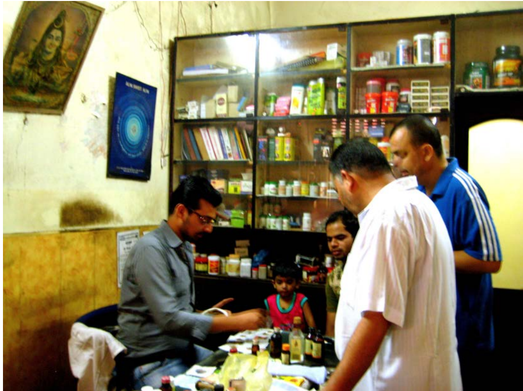
Figure 6. The interior of an Ayurvedic private clinic.

an Ayurvedic clinic below. There are two rooms: in the front room there is a doctor's table and a cabinet with medicines. On the left end of the back wall there is a door into an examination room. The doctor (in grey shirt) is preparing medicine for a young boy (in red) whose brother is standing next to him; additionally, there are two unrelated men (in blue and white) who are waiting for their turn and watching what the doctor is doing.