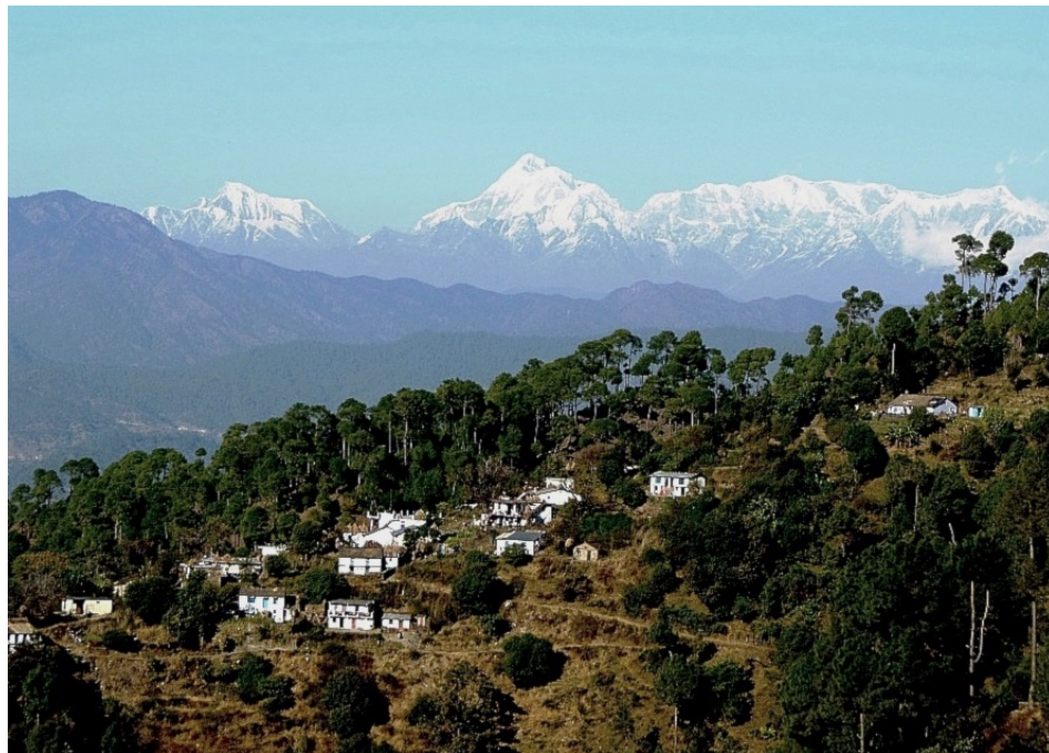
Figure 2. An Uttarakhand village with a view of the Himalayas

problem. As a step further, the state authorities have been investing in schemes for the cultivation of “medicinal and aromatic plants,” striving to both attract investors and alleviate a pressure on the wild. In line with these intentions, in 2002, Uttarakhand was declared an “Herbal State” (Kuniyal et al. 2015, 1147). There are also many initiatives, supported by the government, local NGOs, and international organizations for organic farming (Galvin 2014, 119). Moreover, the state promotes itself through an official nickname Dev Bhumi (the Land of Gods), which refers to the presence of numerous important Hindu pilgrimage sites such as Kedarnath, Badrinath, Gangotri, Rishikesh and Haridwar. Such promotion as an “herbal state” and the “divine land” points to Uttarakhand’s strategic competition with other North Indian states for claiming a unique cultural and commercially significant role in the Himalayas.