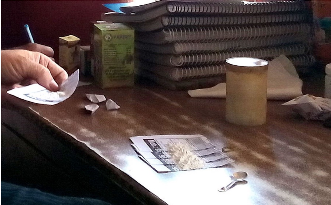
Figure 7. A Unani doctor prepares medicine

Some doctors turn their private clinics into spaces that look more like pharmacies, which offer a variety of pharmaceuticals and beauty products, such as the shampoos and facial creams. This mise-en-scene is typical of many private clinics I visited. Other practitioners open actual pharmacies. For example, once when I was walking through the market in Chhotapur, I spotted a chemist shop with a sign “Naturopathy.” The interior did not differ from any allopathic pharmacy in the town, with glass shelves running along the walls, filled with pills, drops, ointments, beauty products, and few home appliances. Intrigued, I approached the owner: Najhoi turned out to hold a diploma in Yoga and Naturopathy (DYSN) and a diploma in pharmacy. Since Yoga and Naturopathy are drugless therapies, their combination with pharmacy seemed paradoxical but Najhoi explained that in order to provide naturopathic treatment he needed land, for which he did not have sufficient capital. So he opened a pharmacy with a hope to save money for his future naturopathic facility. Najhoi claimed that people were not interested in slow,