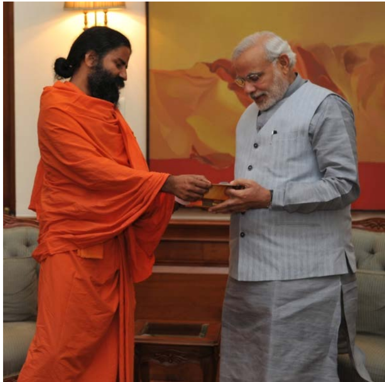
Figure 3. Ramdev with the Prime Minister of India Narendra Modi

unprecedented ways” (Sarbacker 2014, 352). In fact, the core objective of a yog shivir —public and collective participation in a ritualized practice—is so easily amplified with the help of the Internet and television and it is so powerful in creating both visceral and visible national unity, that even Prime Minister Modi has deployed it in order to mobilize Indians to perform the nation.