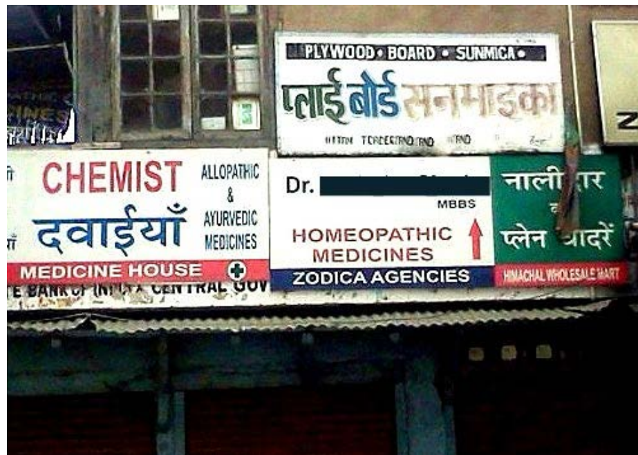
Figure 9. Signboards of an ayurvedic/allopathic chemist shop and a private homeopathic clinic Notice that on the central board beneath the doctor’s name (which I blackened for anonymity), the doctor’s degree is biomedical (MBBS), whereas the advertised clinic is homeopathic.

to the use of other AYUSH systems by allopathic doctors, I am not aware of any study, but I came across several remarkable cases during my fieldwork. One day in 2013, when I was in Himachal Pradesh, I spotted a building with a signboard which read “Homeopathic Medicines,” with a name of a doctor and his medical degree, which was surprisingly MBBS, not BHMS. Curious, I went inside, hoping to interview this allopath who was running a homeopathic dispensary. Unfortunately, when I approached him, he said that he did not have time for an interview, but directed me to a side room to speak with his wife. As we talked, I learned that she did not have any medical degree, but held a registration for a homeopathic dispensary and was in charge of dispensing medicines which her husband prescribed. She told me that her father-in-law was a homeopathic practitioner, and her husband grew up learning about Homeopathy. So now even though her husband went to a biomedical college and received an MBBS degree, he decided to open a homeopathic dispensary.