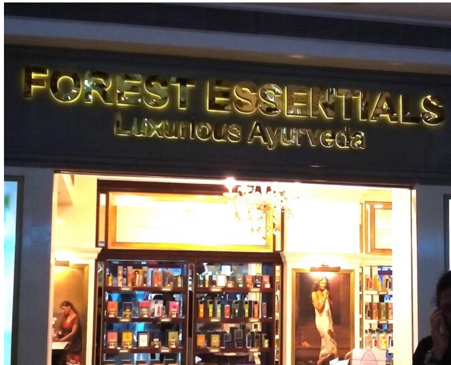
Figure 5. An Ayurveda boutique in Delhi

Nazrul Islam (2010) identified two major categories of ayurvedic products: beauty and medicines. In 2016, we can surely add other categories that have become critically important: “ayurvedic” foods (noodles, biscuits, ketchup), household supplies, and other ayurvedic products. Notably, there is no “luxurious Unani.” 87