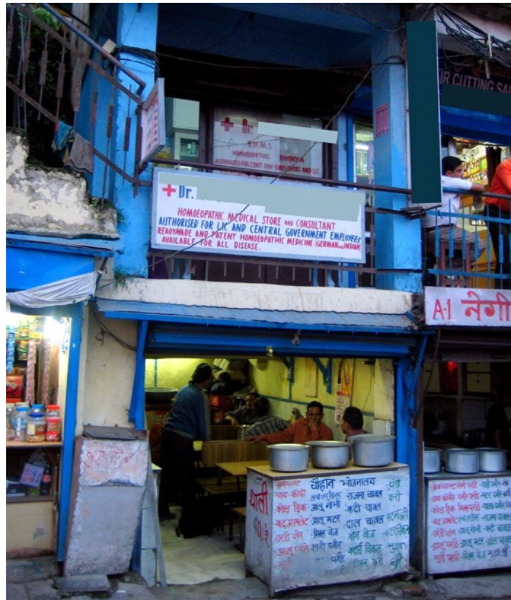
Figure 8. A private homeopathic clinic in the middle of the market

While some practitioners shuttle between private clinic and charitable work at religious spaces, other doctors engage in a daytime employment at a government or private hospital and an evening private practice at home. Here it is imperative to look further into the demarcation of private and public space. Criticizing the tendency of Western scholars to draw a boundary between the concepts of “state” and “society,” Akhil Gupta (1995) has remarked that these concepts are built on a belief that bureaucrats operate in offices, courts, and cantonments, i.e. places distinct from people’s private homes. Yet, in India, local authorities and magistrates routinely conduct state affairs from home, receiving citizens, considering complaints and solving disputes, thus collapsing the boundaries between an official and a person (Gupta 1995, 384). In a similar way, many non-biomedical practitioners collapse the boundaries between public and