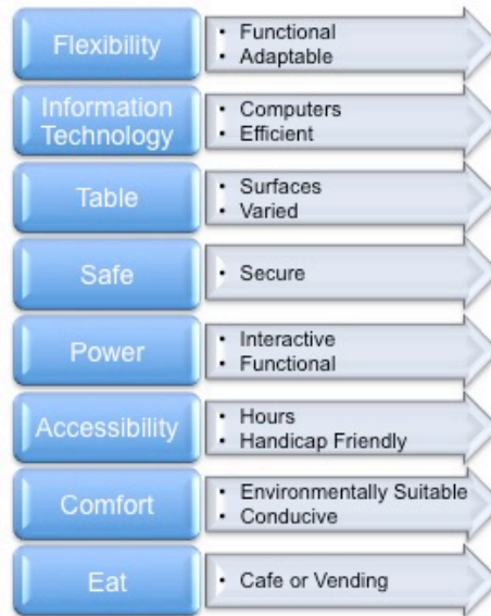
Figure 5. FITSPACE and the Ten Commandments

4 displays their composite model; note that the Group included McDonald's (2006) "wow" factor in their assessment, but did as a separate entity.