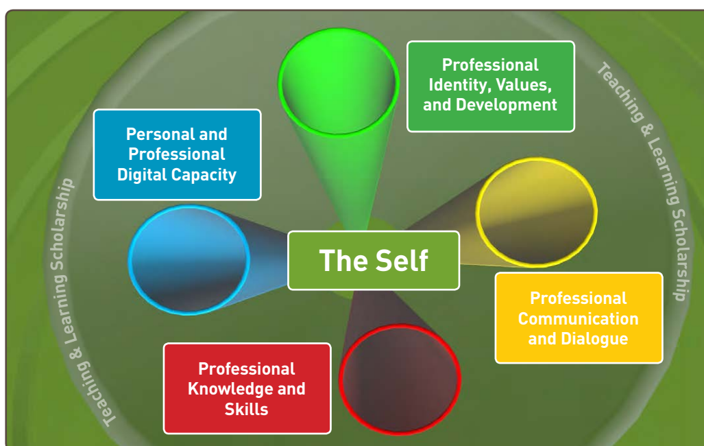
Figure 2: The domains, underpinned by the framework's values.

The framework incorporates five overarching domains, each expanded through a series of elements. The uniqueness that each individual brings to their teaching is acknowledged by placing 'the self' (Domain 1: Personal Development) at the centre of all professional development activity (Figure 2).