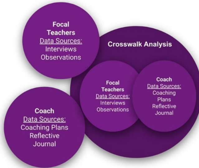
Figure 4. Crosswalk Analysis

Kavanagh & Danielson, 2019). I looked for and documented recurring language and interactions between my coaching data and the data of the focal teachers to see if there were relationships between the two sets of data.