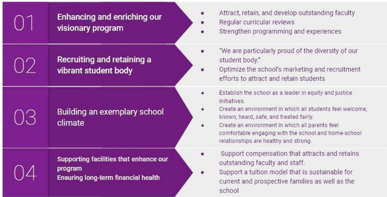
Figure 1. Elements of The Ellis School's Strategic Plan Pertaining to Cultural Responsiveness