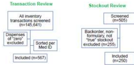
Figure 1. Inclusion/Exclusion Criteria

The stock-out reporting form developed in this project can be found in Appendix A. The procedure for use is as follows: when a medication order label prints, a technician or pharmacist will be prompted to dispense the medication. When finding insufficient quantity to fill the order, the technician or pharmacist will place the label on this stock-out sheet and answers the questions listed. For example, if the inventory management system reports there are 255 amlodipine 5 mg tablets, but the technician encounters an empty bin when physically dispensing the supply, the technician would indicate the “med is out of stock” and mark “inventory count incorrect”.