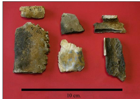
Figure 2 Colour Score 1: A high percentage of the cortical and trabecular bone is black, although some bones may be white or hues of blue and grey (remains from a Lincoln cremation burial, brown residue is encrusted soil)