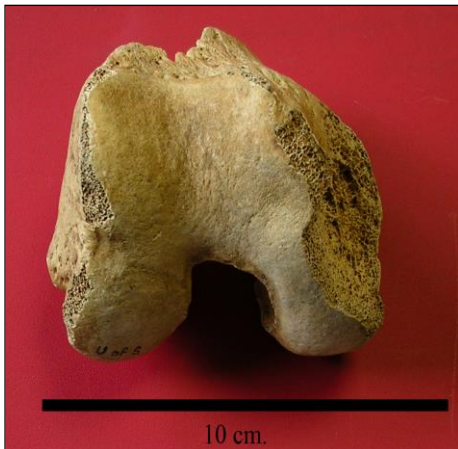
Figure 1 Colour Score 0: Unburned bone ranging from brown to orange (distal femur from the University of Sheffield's osteology teaching collection)

Colour is a macroscopic indicator of oxidization, as brown or orange bones are unburned and black ones are charred ( c. 300°C), while hues of blue and grey are indicative of incomplete oxidization (up to c. 600°C), and white bones are completely oxidized ( c. >600°C) (McKinley, 2004a). Therefore, based on its range of colours, the burials were assigned an efficacy of cremation score on a scale of 0-4, which included increments of 0.5 to indicate when a burial's level of oxidization fell between two established categories (e.g. a score of 2.5 would mean that the oxidization of the burial was between categories 2 and 3). The scoring system was devised by the author and is described in Figures 1-5.