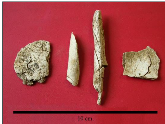
Figure 5 Colour Score 4: Cortical and trabecular bone are completely oxidized and white in colour, trabecular bone is often very fragile (British Bronze Age cremation burial, the dark hues are caused by soil staining)

The colour scores of the cremation burials can be seen in Table 7. The Manton scores ranged from 2 to 3.5 with an average of 3. These scores indicate that the assemblage was incompletely oxidized. Incomplete oxidization (which is typical of Romano-British cremation burials) is caused by the restriction of a cremation's burning time, oxygen supply or temperature (McKinley, 2004b).