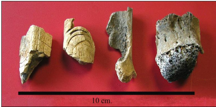
Figure 3 Colour Score 2: Cortical bone is mostly white with patches exhibiting shades of grey, while the trabecular bone is primarily black or hues of grey (remains from a York cremation burial)