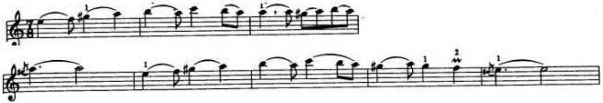
Figure 2. Uighur flavor melody in “Yangguang”

The main melody of erhu in the first section in 7/8 meter continues the mode set by the piano: (Figure 2).